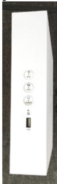
Telstra Gateway Max 2 Unit Front[/caption]

[caption id="attachment_2916" align="aligncenter" width="92"]