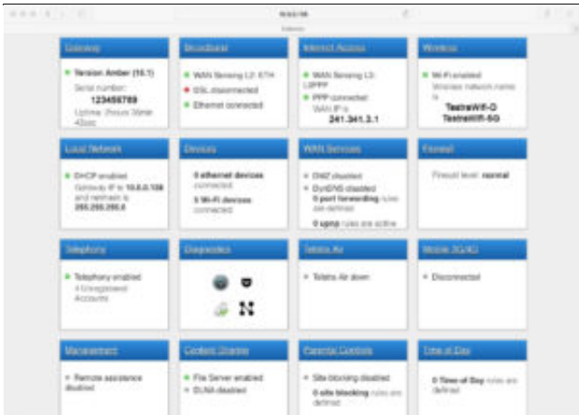
Telstra Gateway Max 2 Advanced Options[/caption]