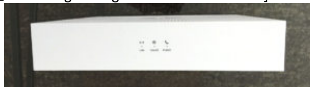
Telstra Gateway Max 2 Unit Top[/caption]

[caption id="attachment_2917" align="aligncenter" width="300"]