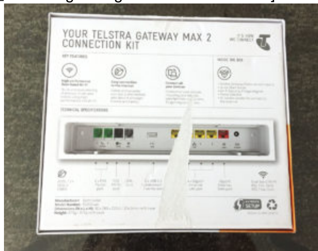
[caption id="attachment_2911" align="aligncenter" width="300"]